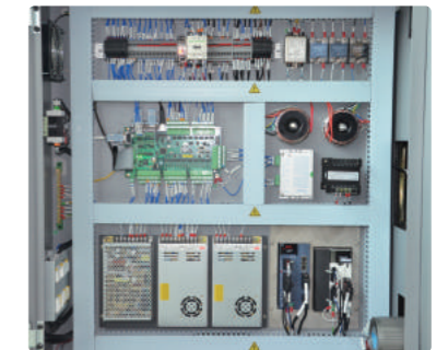
Industrialized wiring makes it more artistic